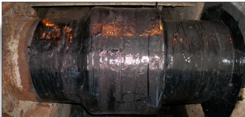
Finished DuraWrap System

6 Platinum Court • Medford, NY 11763 Toll Free: 888-4-ENECON • Phone: 516-349-0022 • Fax: 516-349-5522 www.enecon.com • info@enecon.com