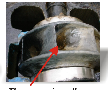
The pump impeller and bottom casing after 9 months continuous duty, showing the DuraTough DL protection of the impeller surface is still in good condition.

700 Hicksville Road • ENECON Center Suite 110 • Bethpage, New York 11714 Toll Free: 888-4-ENECON • Phone: 516.349.0022 • Fax: 516.349.5522 Website: www.enecon.com • Email: info@enecon.com