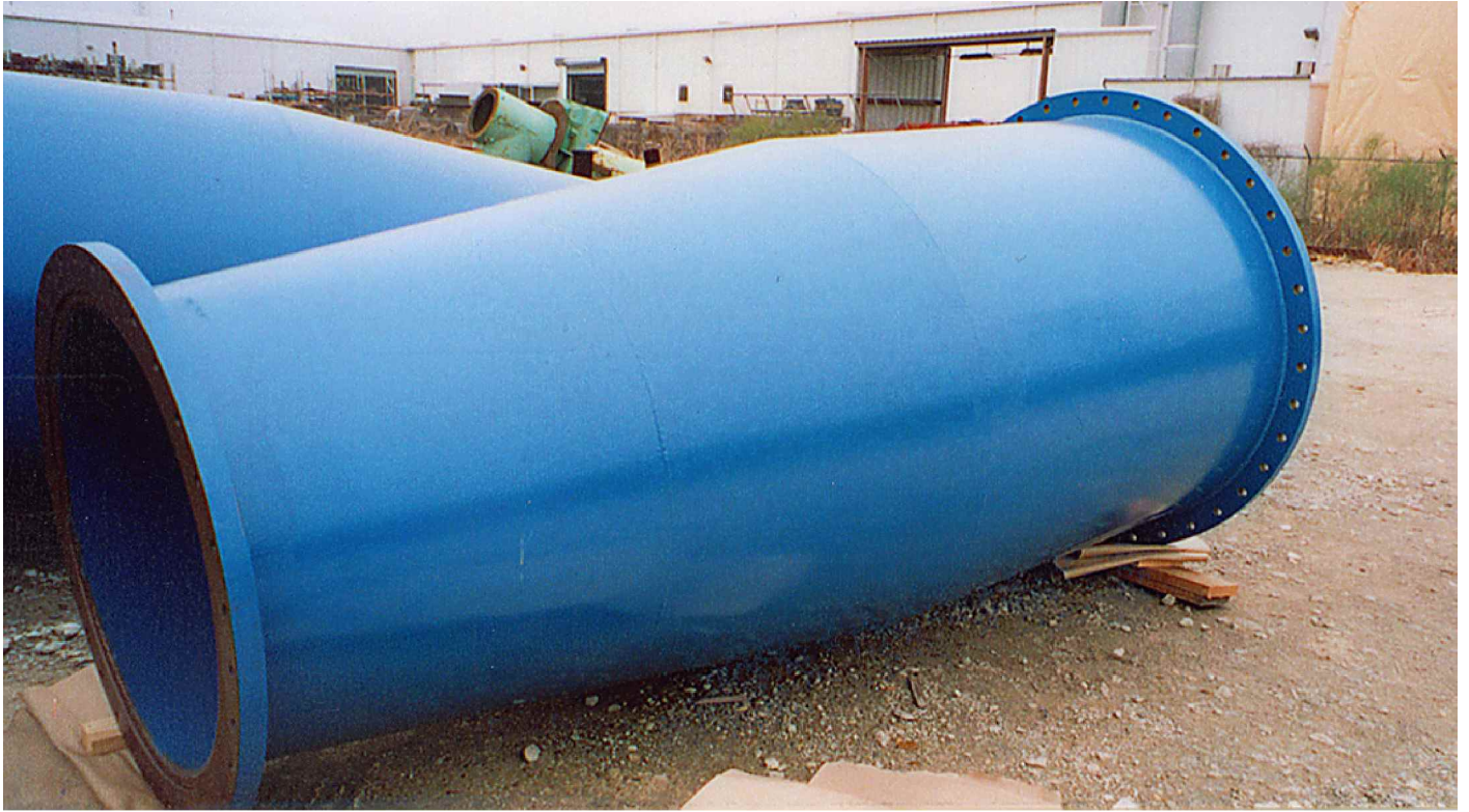
Taper Columns: CeramAlloy inside and outside.