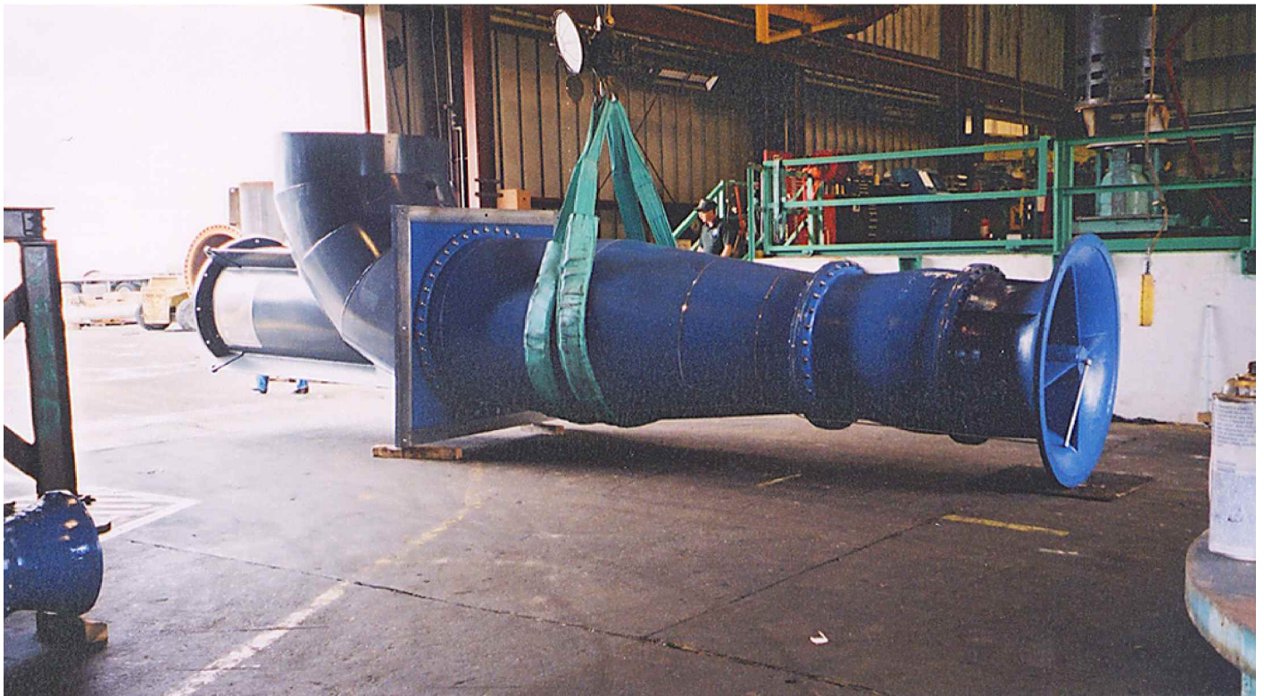
Completed Pump System: includes over 50 ENECON coated parts.