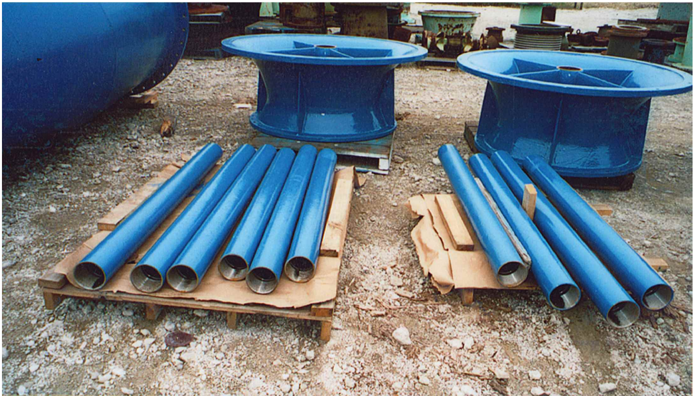
Taper Columns & Pump Heads: CeramAlloy inside and outside.