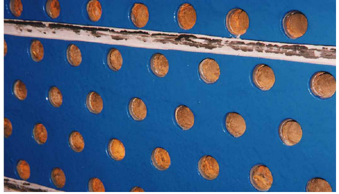
CeramAlloy CL+ applied to complete the project.

700 Hicksville Road • ENECON Center Suite 110 • Bethpage, New York 11714 Toll Free: 888-4-ENECON • Phone: 516.349.0022 • Fax: 516.349.5522 Website: www.enecon.com • Email: info@enecon.com