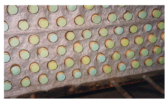
Special ENECON coating plugs installed after grit blasting to facilitate the application of the CeramAlloy system.