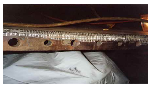
Smooth, ¼ inch thick aluminum angle coated with ENECON

700 Hicksville Road • ENECON Center Suite 110 • Bethpage, New York 11714 Toll Free: 888-4-ENECON • Phone: 516.349.0022 • Fax: 516.349.5522 Website: www.ENECON.com • Email: info@ENECON.com