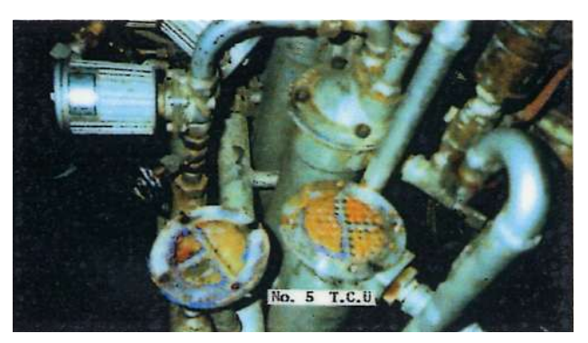
Typical mineral scale build-up on T.C.U.'s