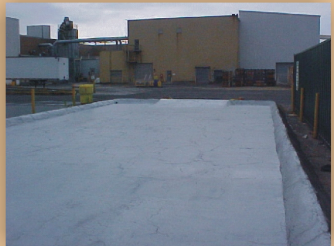
View from the opposite direction. Pallets containing drums of chemicals are stored here.

The ENECON Mid Atlantic Engineering Team completed this entire project in just 4 days to the complete satisfaction of the plant engineers.