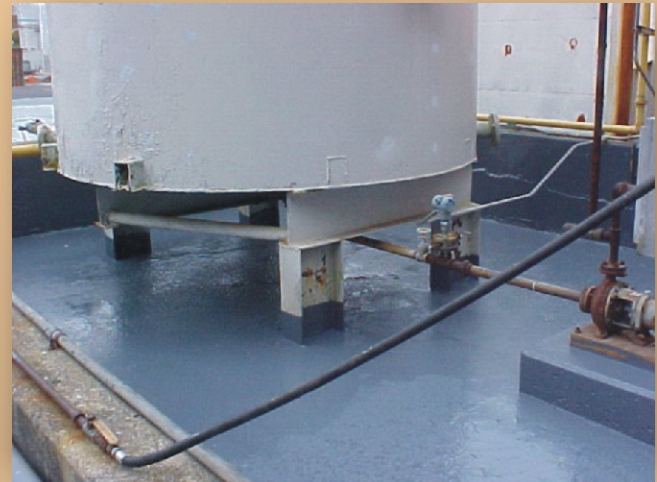
The third containment area was repaired and protected as per the second containment area.

700 Hicksville Road • ENECON Center Suite 110 • Bethpage, New York 11714 Toll Free: 888-4-ENECON • Phone: 516.349.0022 • Fax: 516.349.5522 Website: www.enecon.com • Email: info@enecon.com