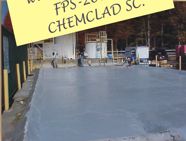
This, the largest of the three areas was first power washed, then abraded with a floor sander; cracks were repaired with ENECRETE DuraQuartz and then coated with ENECLAD FPS 2000.

New Jersey Grout Manufacturer Repairs & Protects Containment Areas with DuraQuartz, FPS-2000 & CHEMCLAD SC.