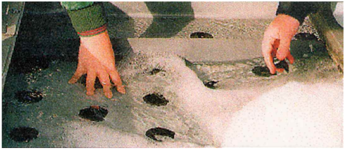
Problems solved & pans protected with CHEMCLAD SC.

700 Hicksville Road • ENECON Center Suite 110 • Bethpage, New York 11714 Toll Free: 888-4-ENECON • Phone: 516.349.0022 • Fax: 516.349.5522 Website: www.enecon.com • Email: info@enecon.com