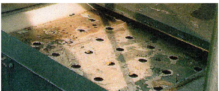
Pool paint peeling on pans poses problems.