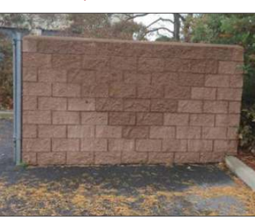
These photos were taken after a heavy rainstorm on Long Island in October, 2014 - 6 years after the initial application.

Just one application of ENESEAL MP (for walls) & ENESEAL MP/HS (for floors/horizontal surfaces) can protect all types of cement and masonry surfaces for up to 8 – 10 years depending on the exposure conditions, i.e. rural, industrial, coastal, etc.