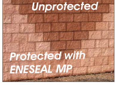
ENESEAL MP was initially applied in October, 2008.