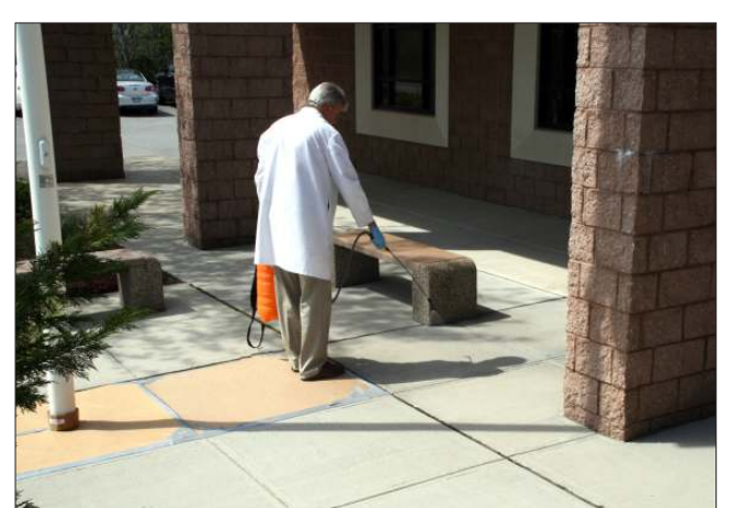
Applying ENESEAL MP/HS with a common garden sprayer.

UV resistance increases protection from sun damage, creating a complete WEATHER RESISTANT BARRIER . By penetrating masonry surfaces to depths of up to <sup>3</sup>/<sub>4</sub> inch, both of these unique ENESEAL materials will not wear away during extreme weather conditions or from foot traffic on horizontal surfaces.