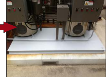
Chemical treatment process station base. Prepared by pressure washing then two coats of ENESEAL® CR.