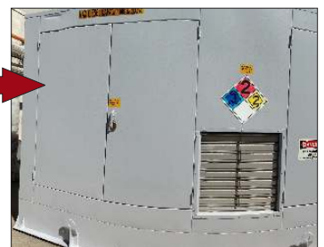
Electrical cabinet. Prepared by pressure washing then two coats of ENESEAL® CR.