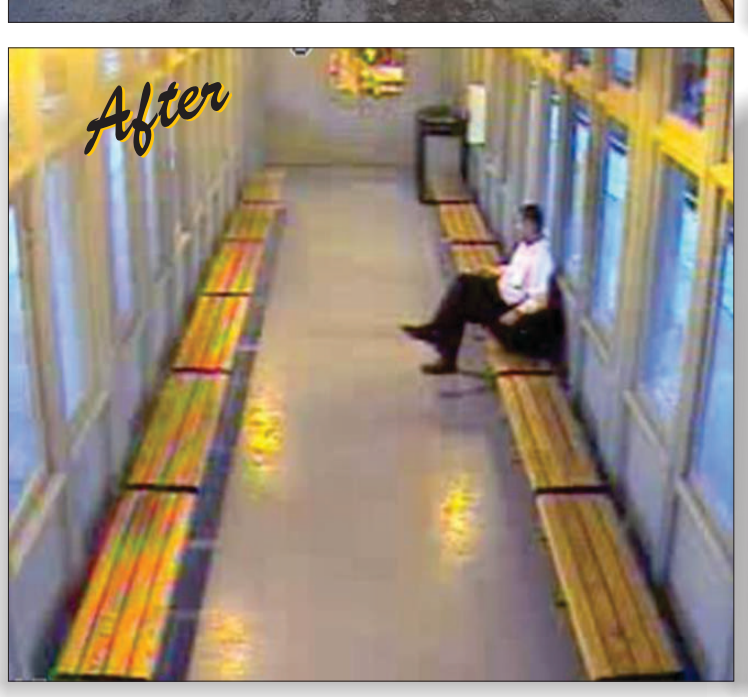
CHEMCLAD P4C was used to prime and seal the concrete surface.