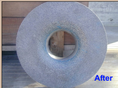
Protected With CeramAlloy CBX