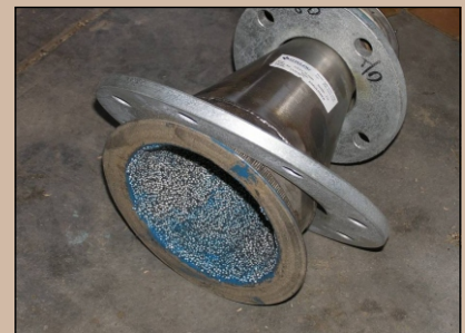
Another View of Cyclone

700 Hicksville Road • ENECON Center Suite 110 • Bethpage, New York 11714 Toll Free: 888-4-ENECON • Phone: 516.349.0022 • Fax: 516.349.5522 Website: www.enecon.com • Email: info@enecon.com