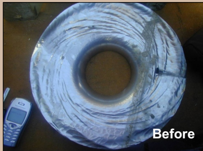
Sulzer Pump Parts - Paper Mill