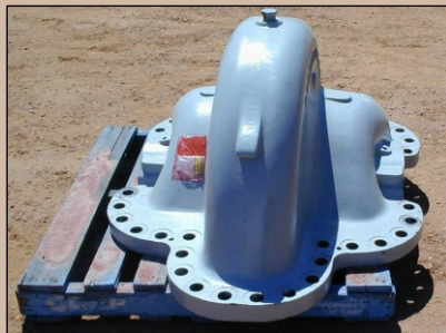
Filtrate Pump - Alumina Refinery