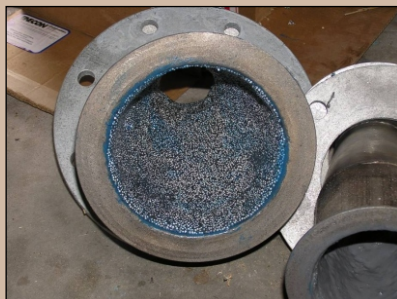
Paper Recycling Mill Cyclone