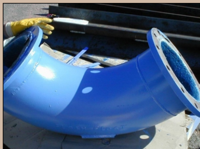
Primary Feed Spool