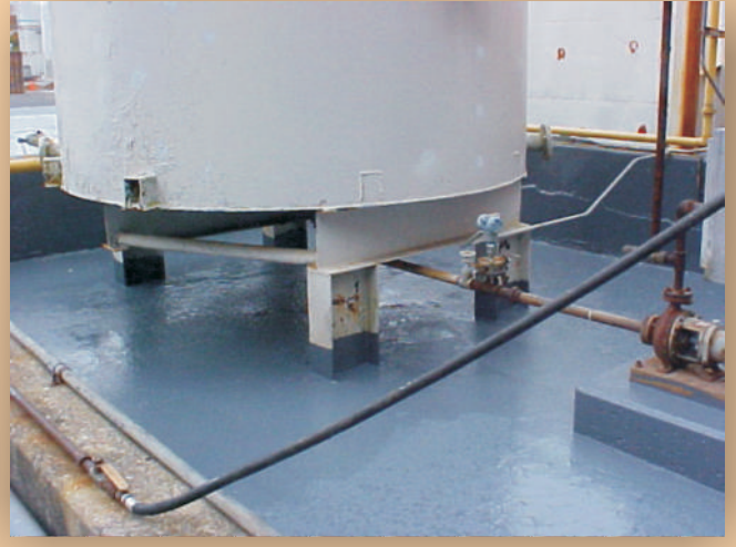
The third containment area was repaired and protected as per the second containment area.

700 Hicksville Road • ENECON Center Suite 110 • Bethpage, New York 11714 Toll Free: 888-4-ENECON • Phone: 516.349.0022 • Fax: 516.349.5522 Website: www.enecon.com • Email: info@enecon.com