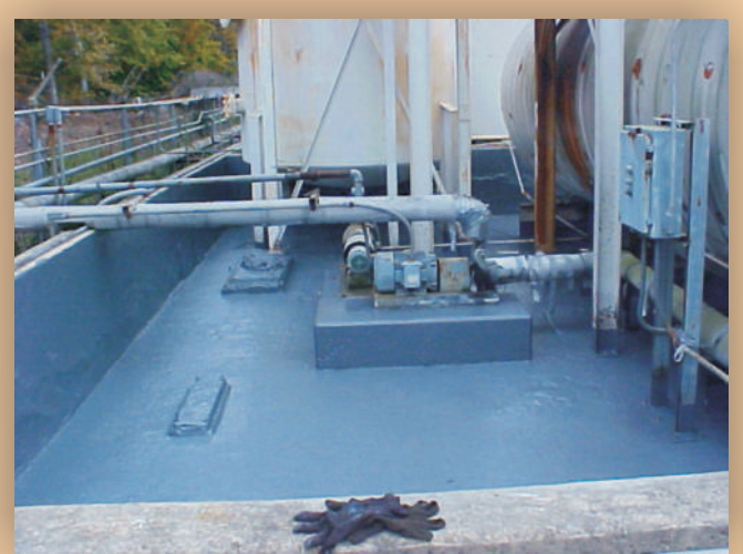
The second containment area was first power washed, cracks were repaired with DuraQuartz, P4C was applied over the concrete followed by 2 coats of CHEMCLAD GP.

View from the opposite direction. Pallets containing drums of chemicals are stored here.