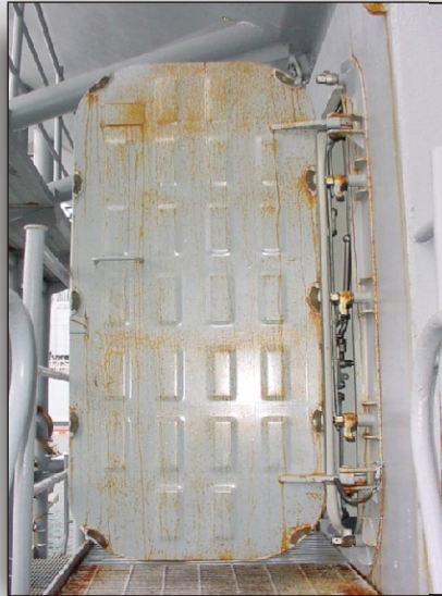
Powder coated doors after a few months at sea.